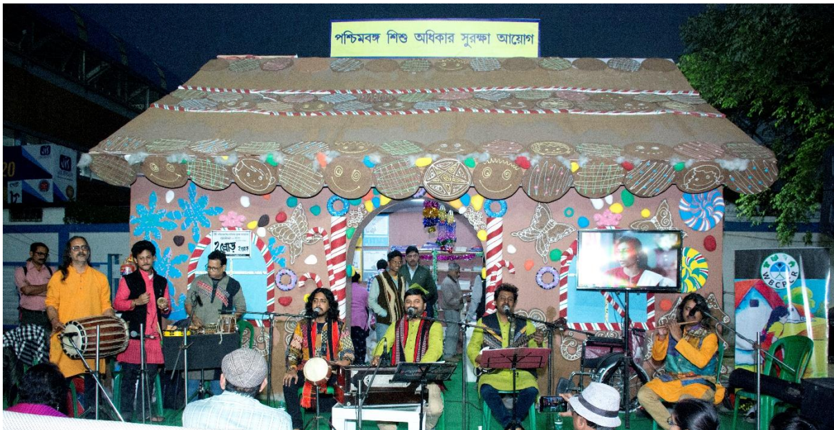
Performance by famous Bangla folk band, DOHAR