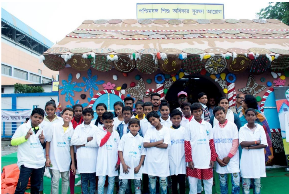
Child Friendly Corner _ supported by UNICEF