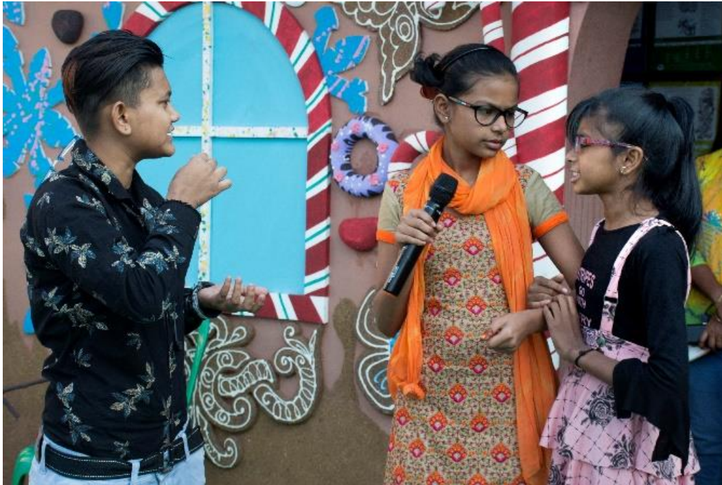
Drama on good touch and bad touch