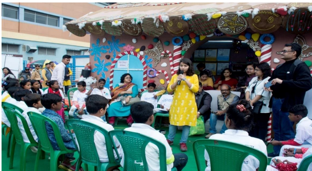
Story writing workshop: Boi Bandhu organized by Mitra and Ghosh , famous publishing house of Kolkata.