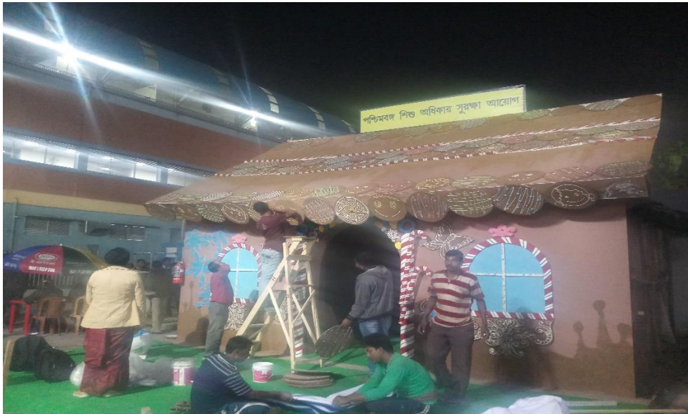
Stall in making

WBCPCR's planning for the Book Fair started six months back with sending the application letter to the Publishers & Booksellers Guild for having a stall at the 44 th Kolkata International Book Fair in 2020. Internal meetings were convened a number of times so that all aspects including budget, interior and exterior design of the stall, participation, strategy of awareness building campaign on child rights issues, sale & distribution of Hullor were to be looked into properly. On January, 2020, a rectangular space of 600 square feet was allotted by the guild committee to the Commission at the Central Park Mela Ground, Saltlake and Child Friendly Corner was created there by the Commission with the focal theme Hansel and Gretel, one of the most popular children's classics of Germany.