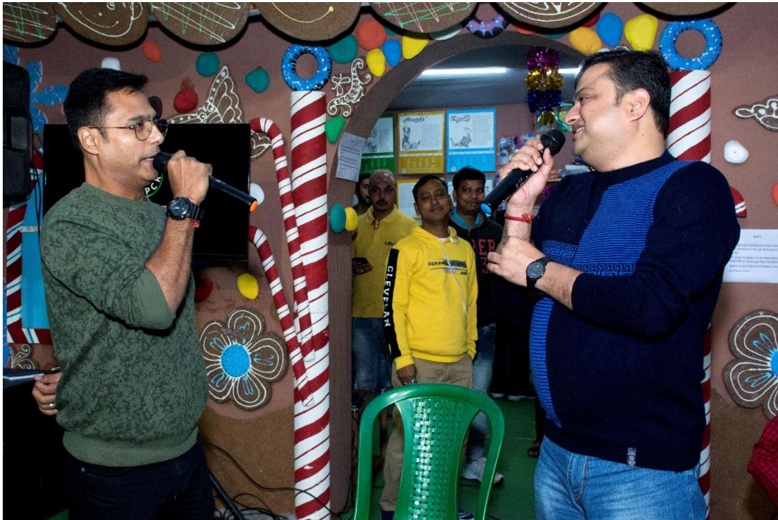
Biswanath Basu, popular Tollywood actor took the acting workshop for the children.