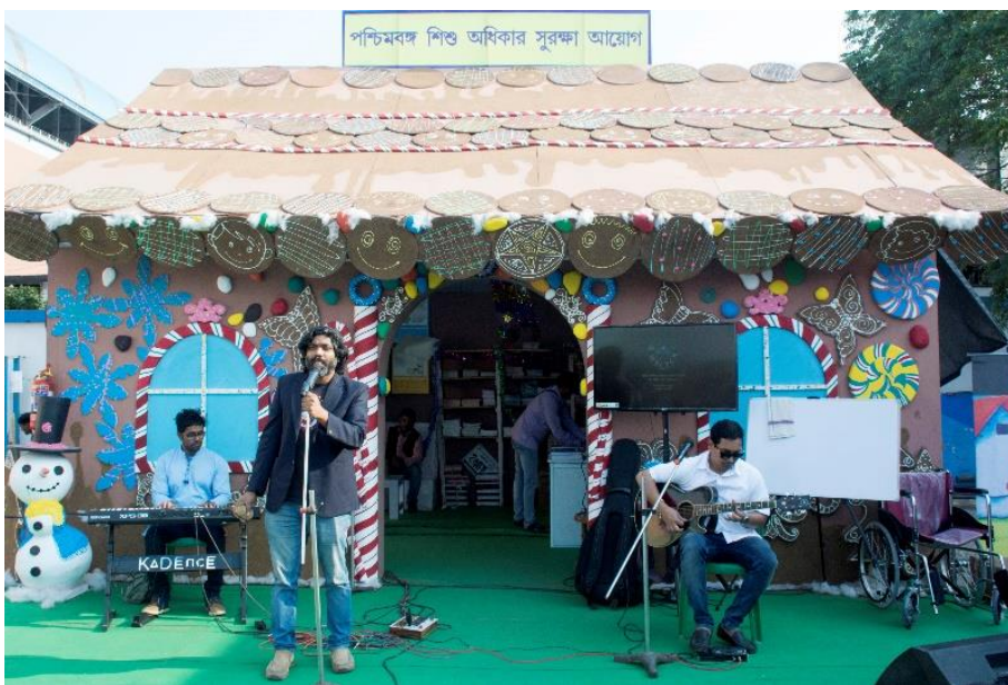
Performance by JOWAR, Bangla folk