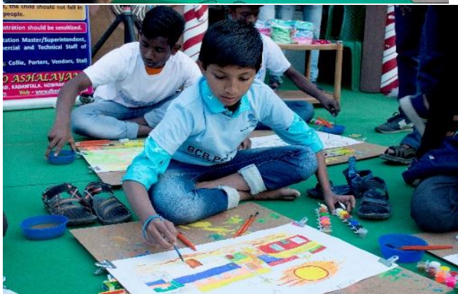
Art workshop by DonBosco Ashalayam