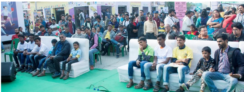
Every day, a huge crowd was seen in front of the WBCPCR's Child Friendly Corner at the Bookfair.